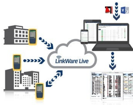
Figure 1. The LinkWare™ Live workflow.

A SaaS for the management of both projects and the cable tester, that also supports list imports of cable IDs from popular tools like AutoCad, Excel™ and VISIO™, not only enhances efficiency but also helps prevent errors. The advantage of such a workflow is obvious if we look at experiences from the past: it was frequently necessary to re-test an entire or a large portion of a project because the first time around the technician had selected the wrong Pass/Fail limits or saved the results using an incorrect cable ID.