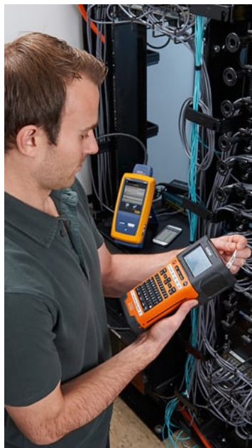
Figure 2. Labeling tools can access the identifiers in the SaaS database to save data re-entry and eliminate labeling errors.

This enhanced workflow is possible because all involved team members can focus on their area of expertise. The Project Manager focuses on the test and quality plan, which involves test regimes, limits and standards as well as cable IDs and naming schemes. In the final stage, the SaaS will also assist the Project Manager in producing the necessary documentation which is often the last milestone before customer invoicing. This leaves the technician to focus on what he was trained to do best: test and troubleshoot.