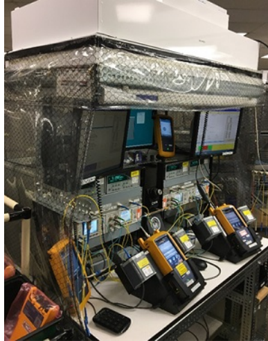
Figure 2 - Fiber calibration station. Note the plastic around the station on the filtration system on top to reduce dust. Some of the commercially available products used are modified by Fluke Networks to meet our accuracy requirements.

Each fiber calibration station features over $80,000 worth of lab equipment, including a number of instruments and adapters that are modified by Fluke Networks engineers to meet our stringent accuracy requirements. (See Figure 2)