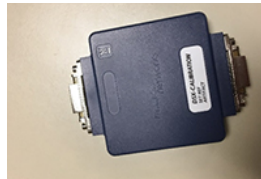
Figure 3 - One of the seventeen copper calibration artifacts as used in our service centers. Encased in plastic shell for protection.