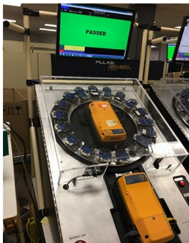
Figure 1 - Copper calibration station. Seventeen custom designed artifacts are connected to the Versiv unit in sequence in order to calibrate it. The automated wheel setup is used only in the factory in order to handle production volumes.

In calibrating your DSX CableAnalyzer™, Fluke Networks utilizes a series of seventeen testing devices (Figure 1) that plug into your instrument. These testing devices are called calibration artifacts. Each custom-made artifact is designed to test and calibrate a different measurement, such as NEXT and FEXT, insertion loss, return loss, attenuation, and resistance for all four pairs across a full range of relevant frequencies. Each artifact contains complex circuitry, and the entire set of copper calibration artifacts has a total value of $10,000.